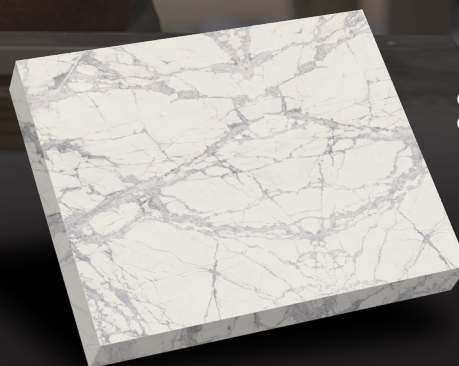
Corian® Endura™ Cool Marble.

While high performance porcelain, sintered stone, and ultra-compact surfaces are all part of the porcelain category, there are differences across the quality and ease of fabrication. Some types of porcelain are difficult to cut due to a reduction in cutting speeds and potential concerns around breakage. However, once installed, porcelain is one of the most durable surfaces available. By contrast, Corian® Endura™ can be cut smoothly, making it incredibly easy for fabricators to work with.