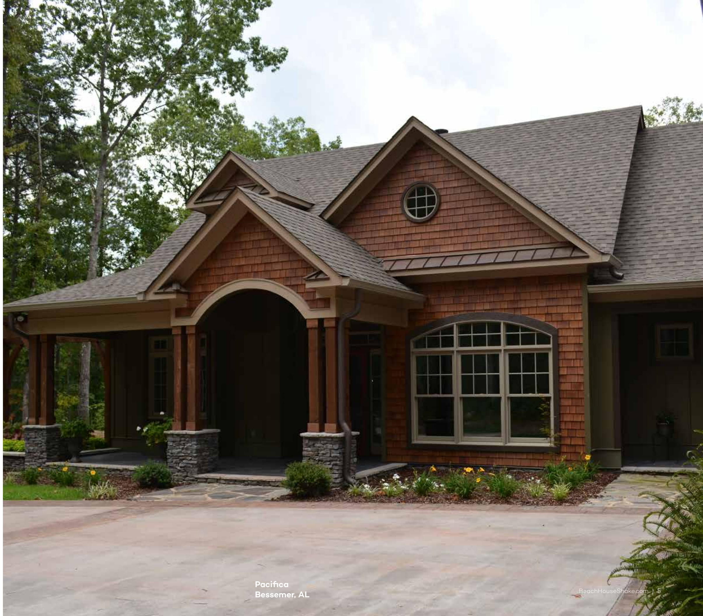
Pacifica Bessemer, AL