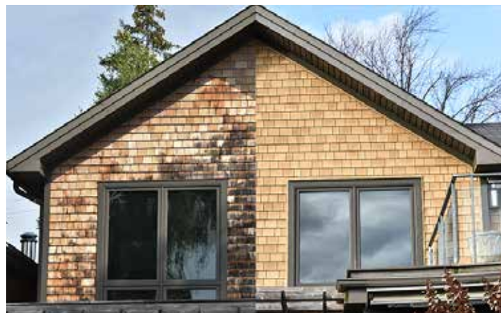
BEACH HOUSE SHAKE