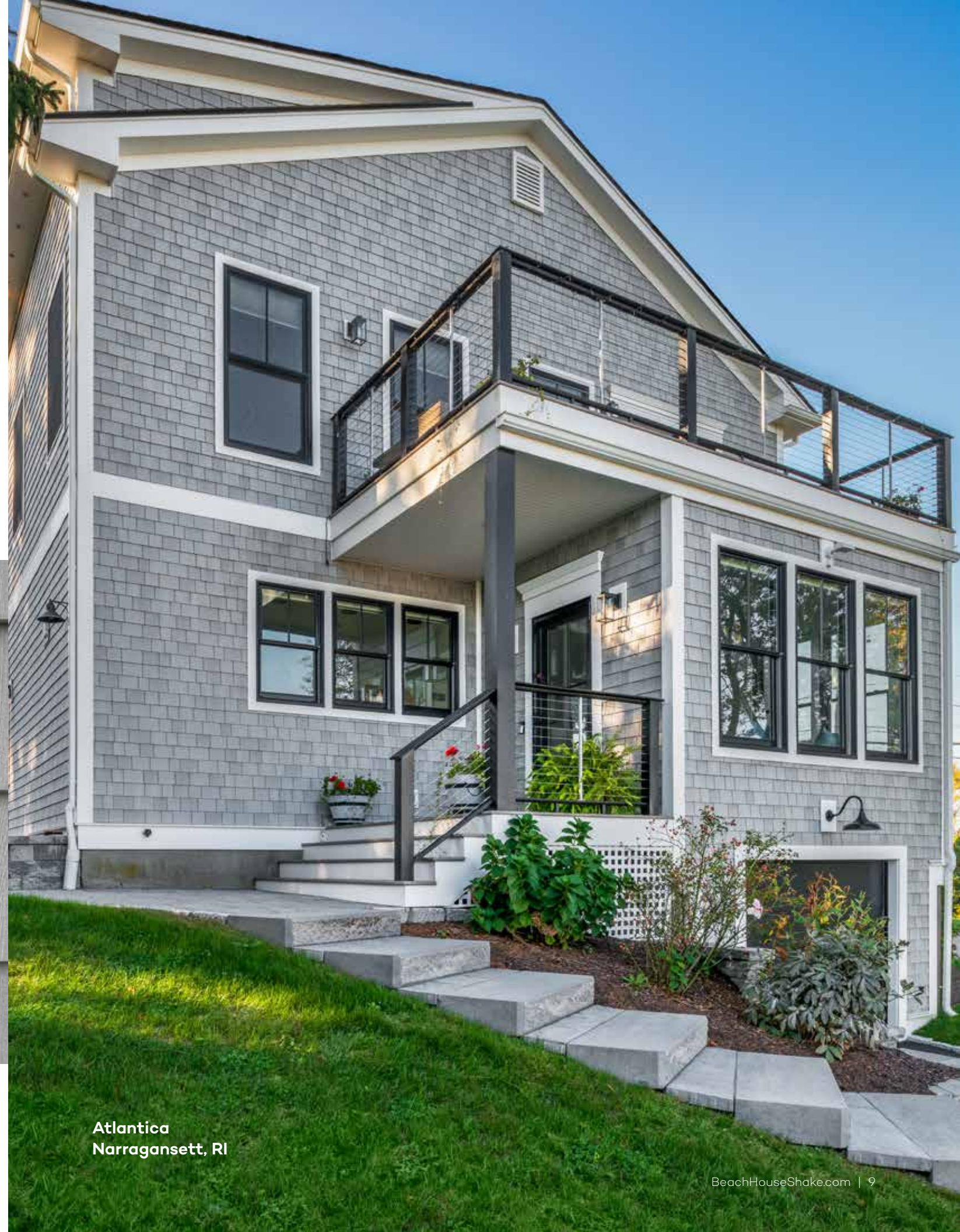
Atlantica Narragansett, RI

Capture the silvery gray tones reminiscent of bleached cedar shingles typically seen in northern coastal regions. Atlantica is the perfect way to replicate the charm of a seaside beach house.