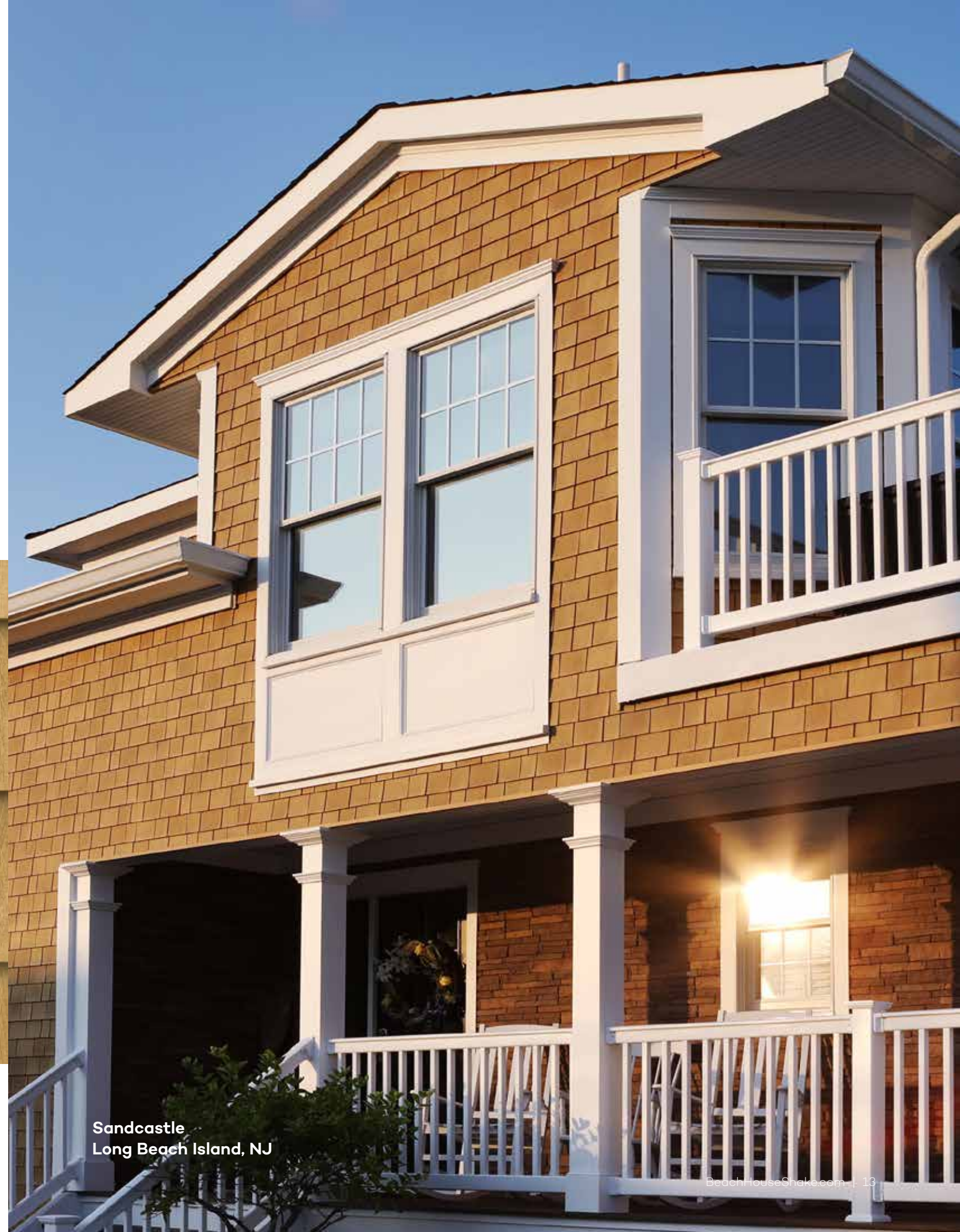
Sandcastle Long Beach Island, NJ

Achieve the classic appeal of brand new eastern white cedar shingles. Sandcastle looks stunning on full walls and entire homes, and can also be used to brighten and accentuate architectural details such as gable ends. Its simple beauty will last for the life of the home.