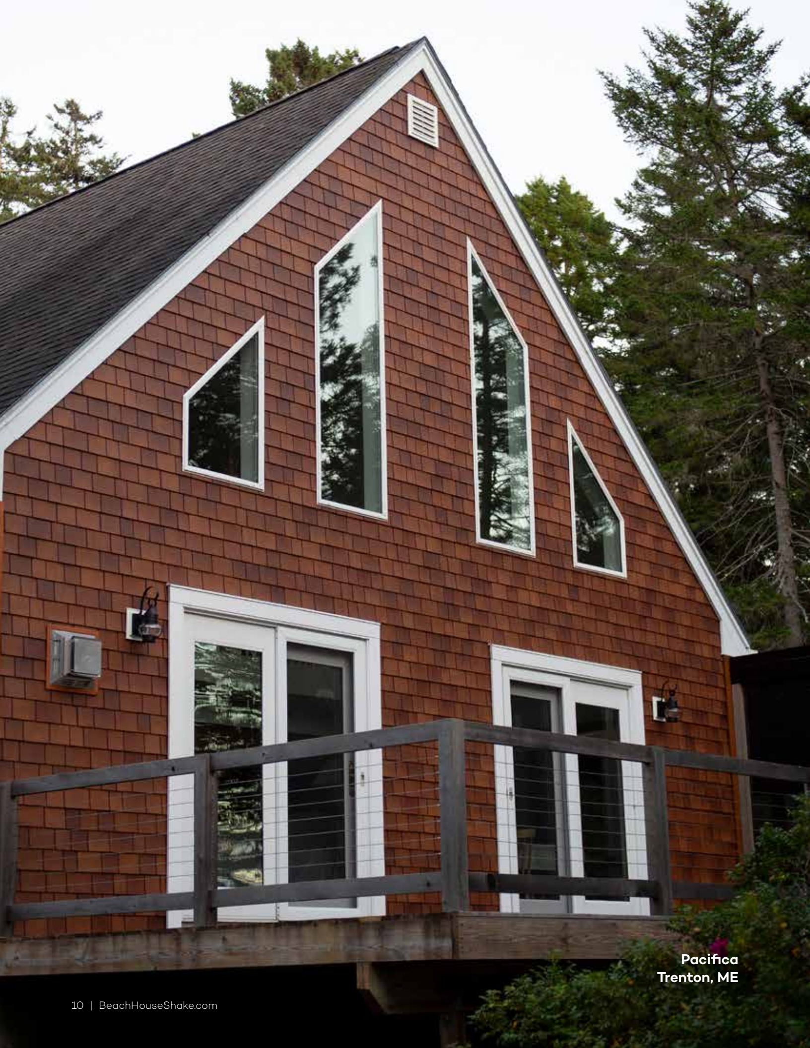
Pacifica Trenton, ME