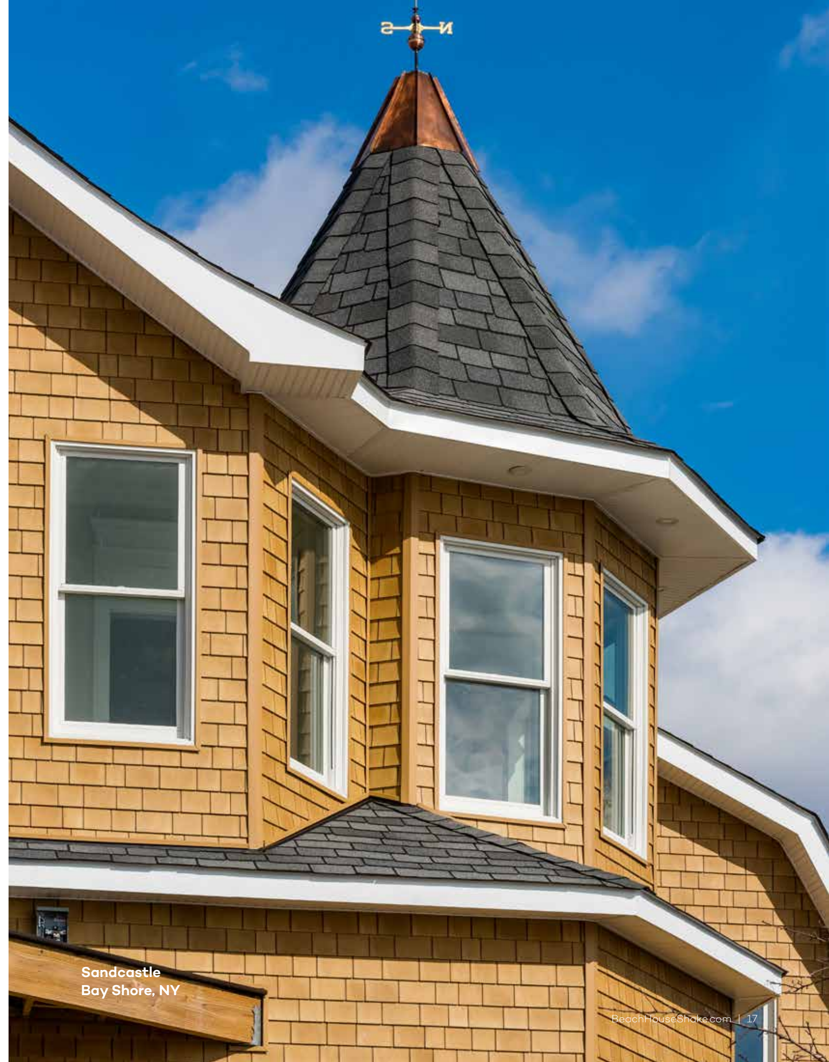
Sandcastle Bay Shore, NY