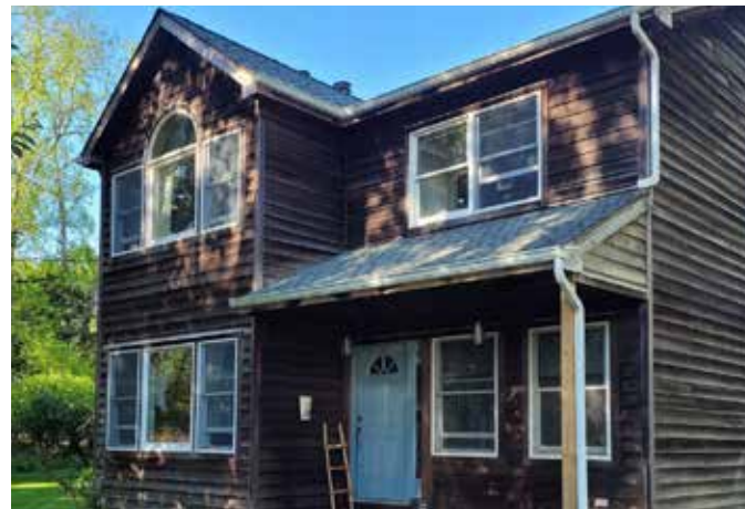
BEFORE Photo submitted by customer

A homeowner from Southampton, New York was not happy with the look of his home. Like all exposed natural cedar, it had discolored quickly, unevenly, and was unsightly. He submitted this "Before" photo and asked for help with a visualization using Beach House Shake. The local Sales Rep assisted the homeowner and provided the below "Proposed" image. The homeowner was thrilled with the look and proceeded with the transformation. In late 2022, the homeowner sent us this "After" photo to show how his dream had finally come to life. With the Beach House Shake Visualizer, seeing is believing!