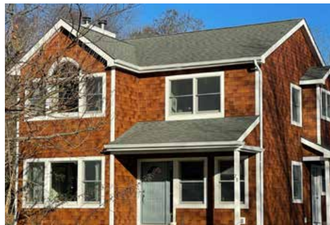
AFTER With Beach House Shake Pacifica Installed