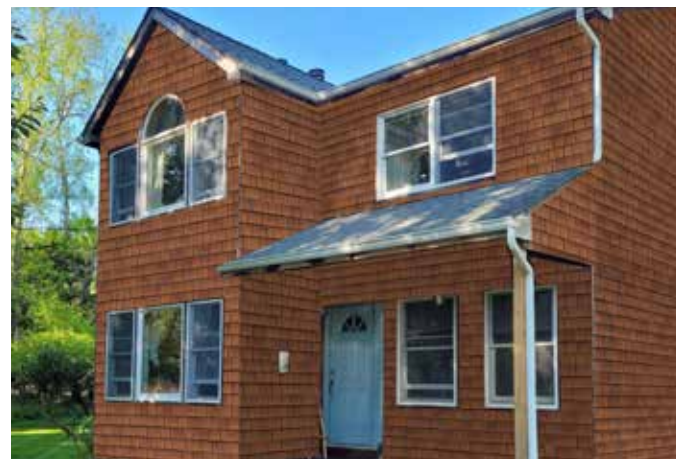
PROPOSED Using the Beach House Shake Online Visualizer