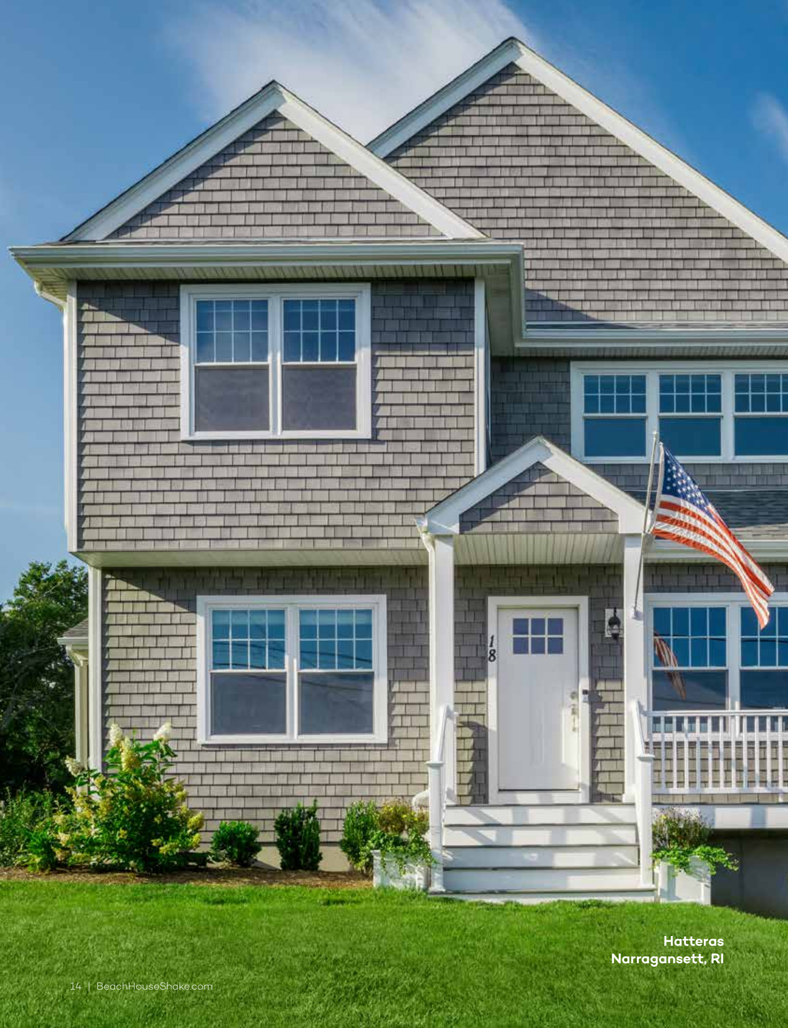
Hatteras Narragansett, RI